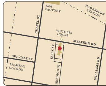
Orthopaedic Foot & Ankle Centre of Victoria Victoria House, 1st Floor, 316 Malvern Rd, Prahran VIC 3181

Investigating the real time pressure while wearing the orthotic allows for precise fine tuning of the device to ensure appropriate offloading of foot segments.